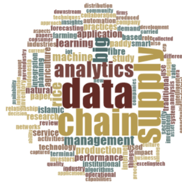
Fig. 3. Word cloud

Based on the publications reviewed in Table 1, applications carried out in the Indonesian context or carried out by Indonesian researchers vary in the direction of upstream, internal supply chain management, or downstream SCM. The dominant application discussed is internal SCM, for example, for demand forecasting, system automation, data security, new product development, or inventory [12–16]. This is not surprising because before paying attention to the upstream or downstream supply chain, internal SCM needs to be strengthened first. For upstream direction, the applications discussed, for example, include supply planning, strategic sourcing, or collaborative SCM [17,18]. Downstream is one of the few that has been studied with the example of logistics and distribution [13,15,17].